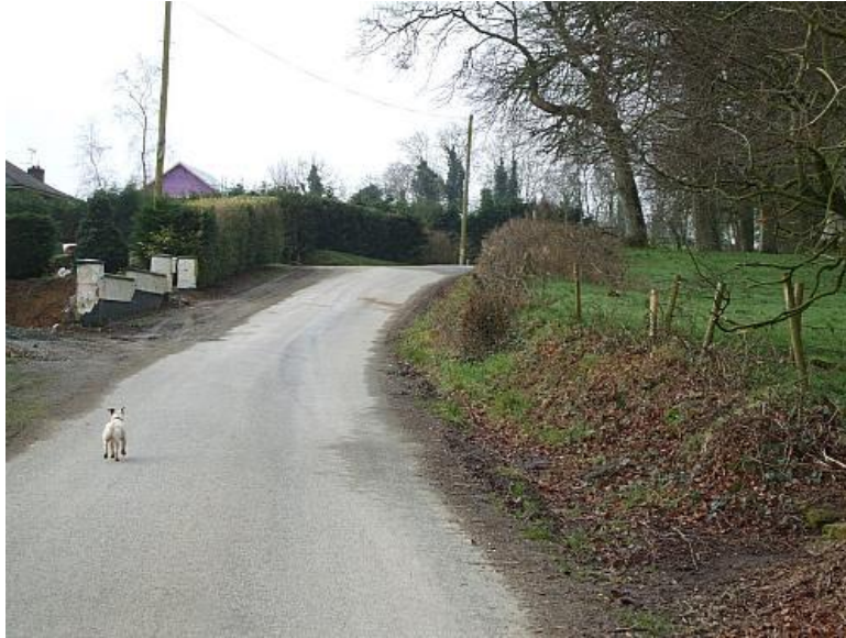
Fig 1. On the road from Navan to Kingscourt.