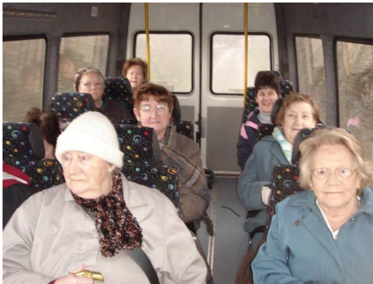
Fig 2. On the bus